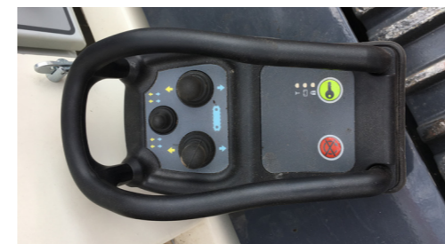
Common track handset for both wireless and wired modes of operation