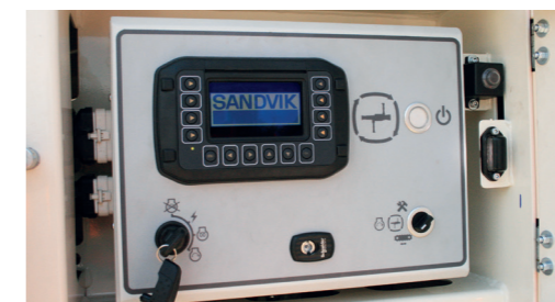
User friendly control system with larger LCD display