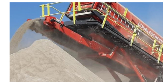
Massive stockpiling capabilities