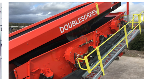
Hydraulically folding walkways for ease of maintenance