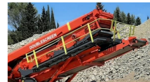
Two-deck Doublescreen with independent screen angle adjustment and screen separation